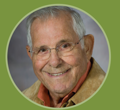
Recipient of the 2011 Shamash Award